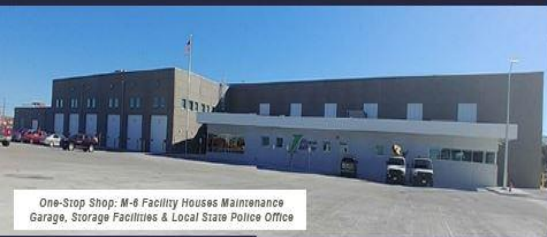
One-Stop Shop: M-6 Facility Houses Maintenance Garage, Storage Facilities & Local State Police Office

ESI Consultants, Ltd. Excellence, Service, Integrity www.esild.com