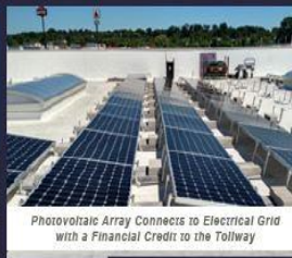
Photovoltaic Array Connects to Electrical Grid with a Financial Credit to the Tollway

Thank you Illinois Tollway and all our teaming partners for a fantastic M-6 Maintenance Facility project!