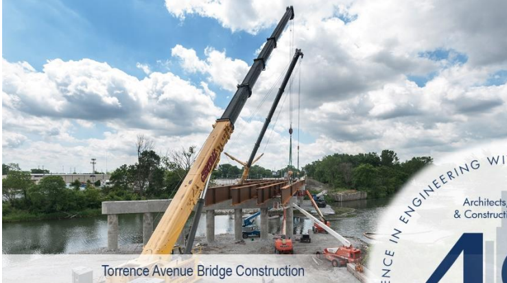
Torrence Avenue Bridge Construction