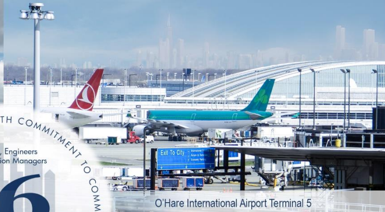
O'Hare International Airport Terminal 5