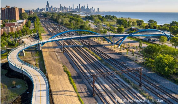
47th Street Pedestrian Bridge

At AECOM, we believe infrastructure creates opportunity for everyone.